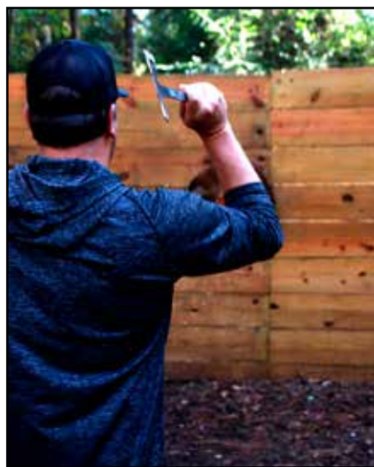
Above: A dad throws an axe at a target. One of the best parts about the Father-Son retreat was the mostly friendly competitions between fathers and sons.

The chief purpose was to guide the maturing of the students