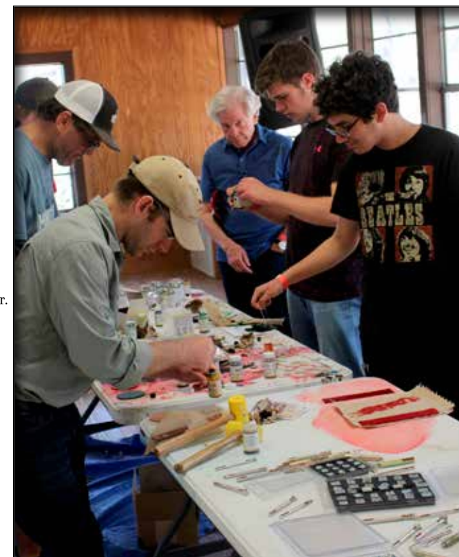
Above and Right: Juniors and their fathers work leather. The options on materials to make included anything from bracelets to belt buckles.

Overall, besides the night, the Father-Son Retreat was serendipitous for the juniors. Everyone thought it would be some lame wishy-washy presentation that no one would honestly want to go to, but it ended up being what can be called a “life-changing” experience. The fathers and sons got to compete in activities that both enjoy, as both the elder and the younger do these activities when they are in their teen years. The presentation was not wishy-washy, but was instead a message important for every man on the planet. As advice for the classes below, the junior class hopes they get to experience it as well.